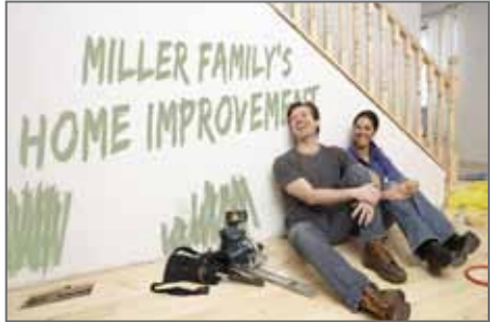
Image personalization with ulmage