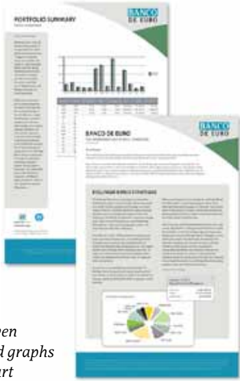
Data-driven charts and graphs with uChart

With uDirect Studio, you can create impressive variable data-driven documents with personalized images and illustrations using XMPie ulmage and Adobe Photoshop® and Illustrator®, uChart delivers attention-grabbing personalized charts based on individual recipient data.